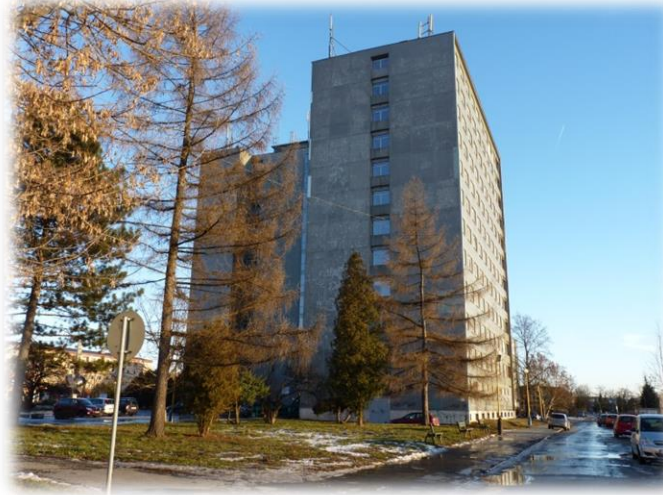
Halls of Residence